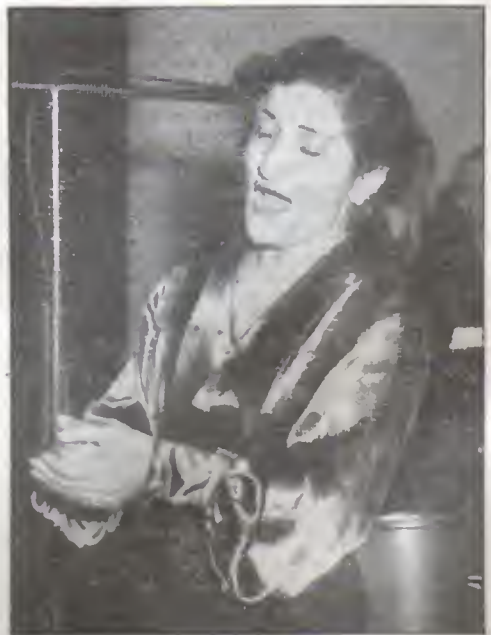
Operatic vocalists, one of whom is shown doing her stuff, are in the majority in any group of aspirants

Now for the National Amateur Hour itself: A few months ago the Health Products Corporation, makers of Feenamint, took cognizance of the unprecedented interest aroused in this new type of program, and decided to sponsor an amateur show over a CBS network. Without frills and furbelows the radio commentators in New York carried a brief announcement to this effect, with the further information that the amateurs would be auditioned on a specified date in the CBS Radio