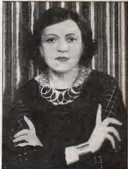
Rosa Ponselle is said to have the perfect, crystal-clear voice. And she augments her natural gift with an artistry and technique equalled by few singers in her field.

"PRINCESS IDA" is the last Gilbert and Sullivan operetta on the schedule of the NBC Players (March 19 at 2:15 p. m. EST, 1:15 CST) and G and S fans over the country will be sorry to have their favorite presentations come to an end.