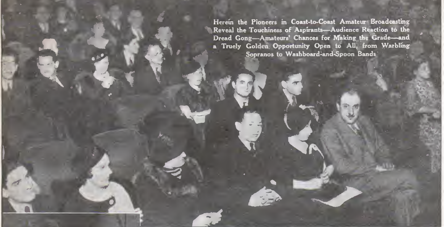
A typical collection of amateurs hopeful of making the tops in radio, shown as they waited their turns to be tried out in the CBS Playhouse, New York

Herein the Pioneers in Coast-to-Coast Amateur Broadcasting Reveal the Touchiness of Aspirants—Audience Reaction to the Dread Gong—Amateurs' Chances for Making the Grade—and a Truly Golden Opportunity Open to All, from Warbling Sopranos to Washboard-and-Spoon Bands