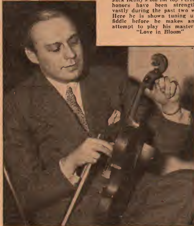
Jack Benny's bid for top Performer honors have been strengthened vastly during the past two weeks. Here he is shown tuning up his fiddle before he makes another attempt to play his masterpiece, "Love in Bloom"