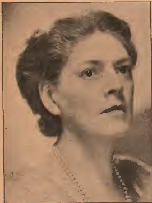
Ethel Barrymore, outstanding star of the stage, whose coming to radio, even as a guest for one appearance only, is considered an event of marked importance

SHANE LESLIE , Irish poet, will shed Light on the Irish Ballad in a special broadcast celebrating St. Patrick's Day from Radio City studios at 10:45 a. m. over an NBC-WEAF network. Leslie will read